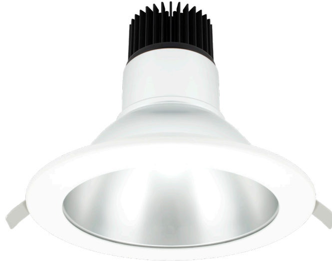
Alzak Multiplier EM6-40-AZ 120-277V AC / 4000K / 2000Lm / 23.8W